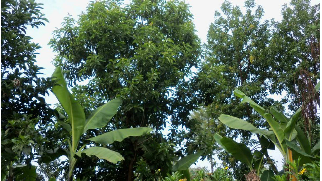
Bí ísíng-ílingémsin letung.